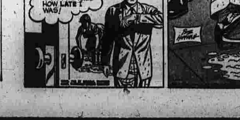
THE STORY OF MARTHA WAYNE